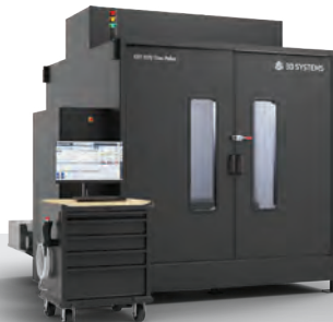
EXT 1070 Titan Pellet / LT